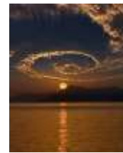
"The Story Continues"